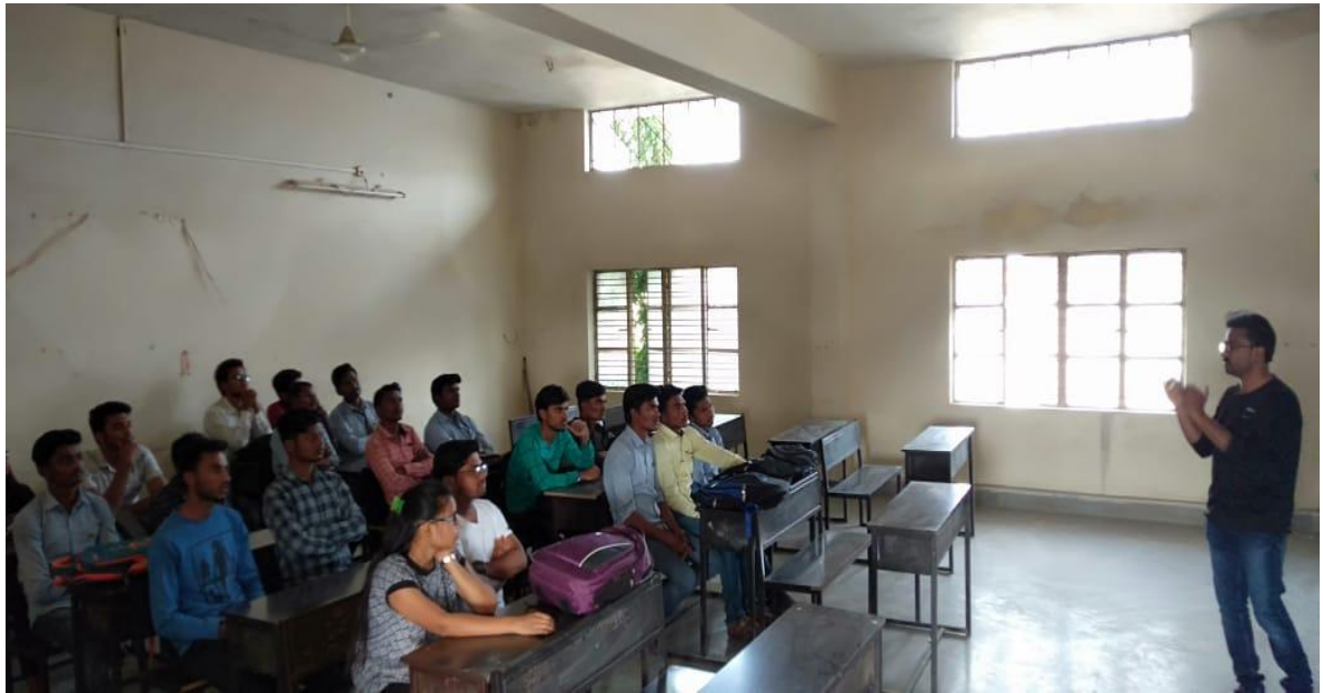
Event 35. Photo of Seminar on industrial processes in Uttam Galva steel industries, Wardha